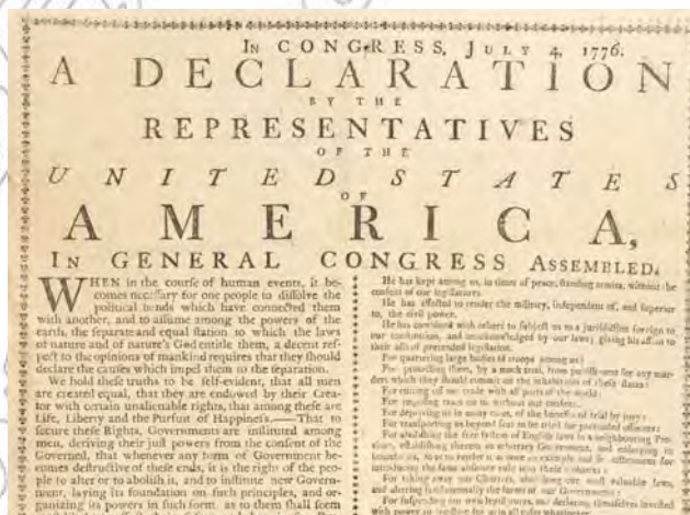
A section of the original Declaration of Independence