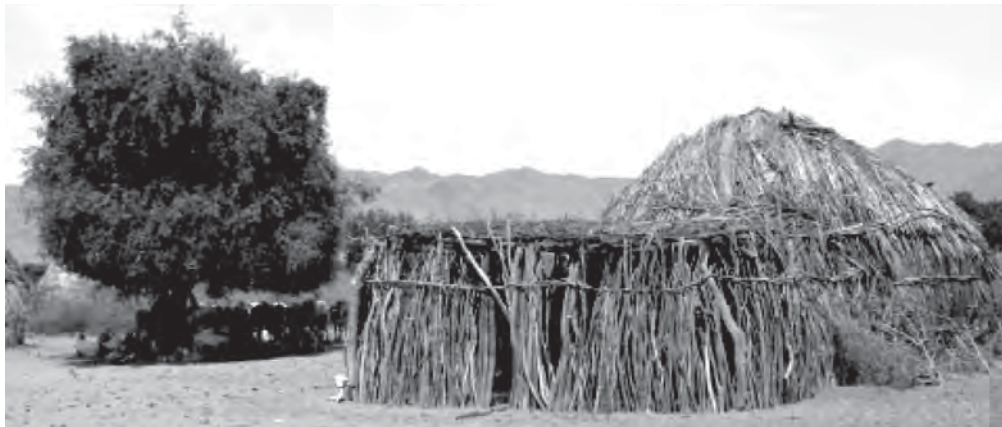
Arbore settlement in SNNPR

? What are the responsibilities of the citizens in the formulation and ratification of their constitution? Discuss in groups.