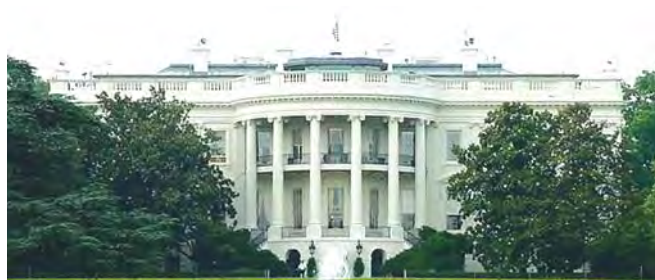
White House, USA — Presidential seat

Moreover, although the President has the power to make treaties with other countries, if the Senate does not agree, then he has to change his action until it is approved. He can also refuse to sign a bill that has been passed by both houses (Senate and House of Representatives), but must explain why, before the bill is returned for a further vote in each house. A majority vote in both houses will ensure the bill becomes law, even if the President does not approve.