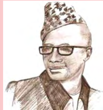
Mobutu — Zaire's dictator

was plunged into debt and was unable to repay loans. His army and police were not paid and thus turned