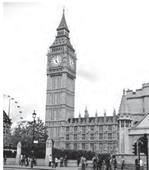
Houses of Parliament in Britain

A Parliamentary Democracy is led by a Prime Minister. He/she is appointed from the winning party and has to be a Member of Parliament. The Prime Minister leads the Executive Branch of government and at the same time is the member of the Legislative Branch. For some, Parliamentary Democracy weakens effective checks and balances between the three branches of government. For others, enacting laws is much easier under a Parliamentary Democracy. Britain is a good example of Parliamentary Democracy.