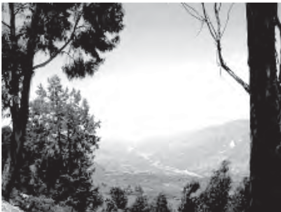
The Abay (Nile) gorge

Ethiopia's foreign relations are geared towards promoting economic development. The country has a strong resolve to undo poverty. Through economic diplomacy, attempts are being made to attract foreign investments to the country. The successful accomplishment of economic diplomacy promotes public diplomacy which promotes people-to-people relations. This in turn helps to maintain durable peace and stability in the country — a condition necessary for the realization of a quantum leap in the development of Ethiopia.